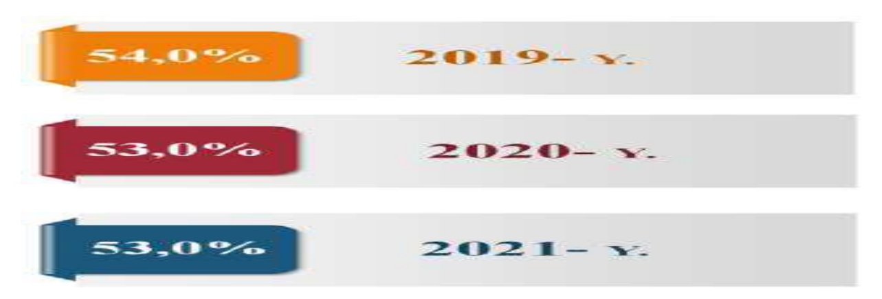
Figure 2 . 2021 \_ January - June months small entrepreneurship The share of entities in GDP, in %

Small businesses (SBs) are the cheapest, most easily managed market entities that are quick to adapt to changes in market conditions. They do not have a significant impact on the deterioration of the environment, unlike large enterprises, do not lead to serious environmental problems. Due to the small size and flexibility of capital capacity, business and entrepreneurship enterprises are more successful than large enterprises in modernizing production and updating the range of products, and therefore adapt more quickly to market demand.