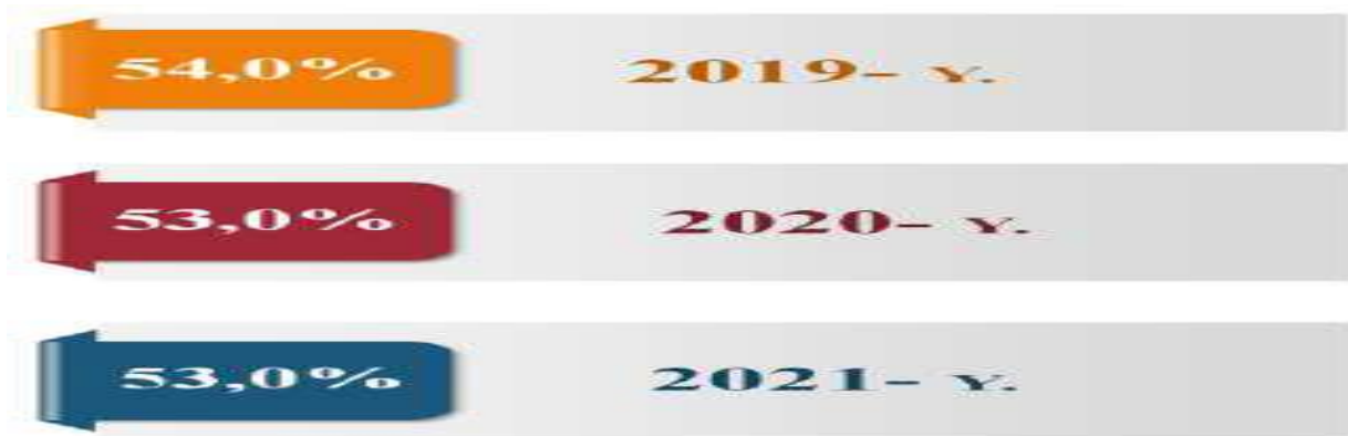
Figure 2 . 2021 _ January - June months small entrepreneurship The share of entities in GDP, in%

Small businesses (SBs) are the cheapest, most easily managed market entities that are quick to adapt to changes in market conditions. They do not have a significant impact on the deterioration of the environment, unlike large enterprises, do not lead to serious environmental problems. Due to the small size and flexibility of capital capacity, business and entrepreneurship enterprises are more successful than large enterprises in modernizing production and updating the range of products, and therefore adapt more quickly to market demand.