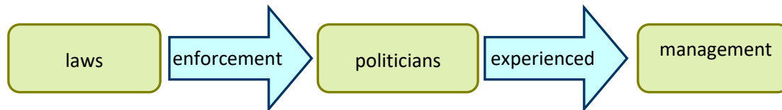
Figure 2. To exercise control according to Plato

According to Plato, the country is governed by laws. Laws are enforced by politicians. Plato knew politicians to be experienced cadres who mastered the art of management (see Figure 2). In his views, Plato emphasized the situational approaches inherent in modern management.